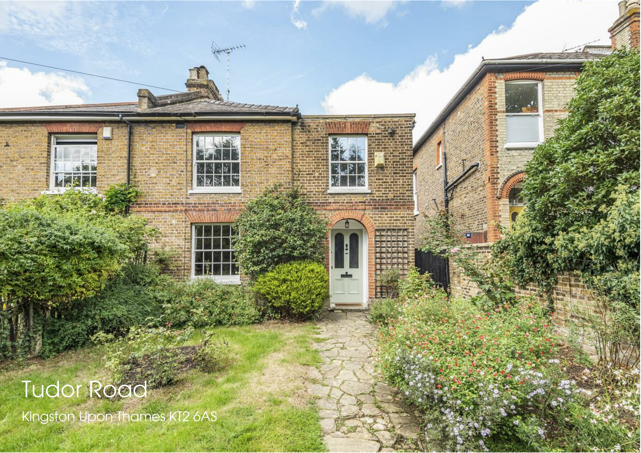
Tudor Road Kingston Upon Thames KT2 6AS